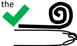
Roll on top of the bandage

Note: The bandage should be placed slightly more medially or laterally to cover more of the paw.