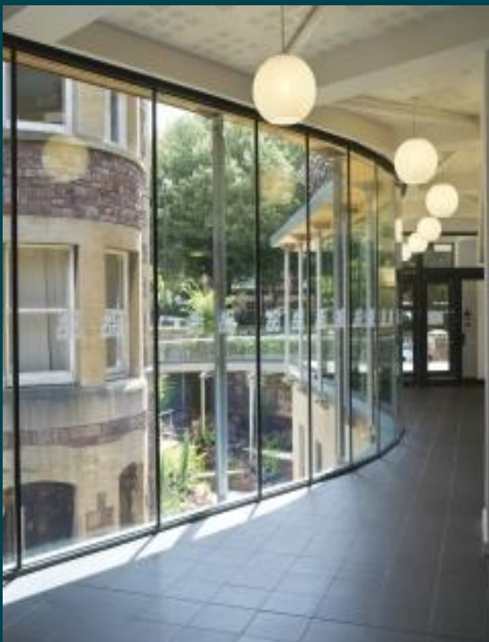
The entrance and foyer