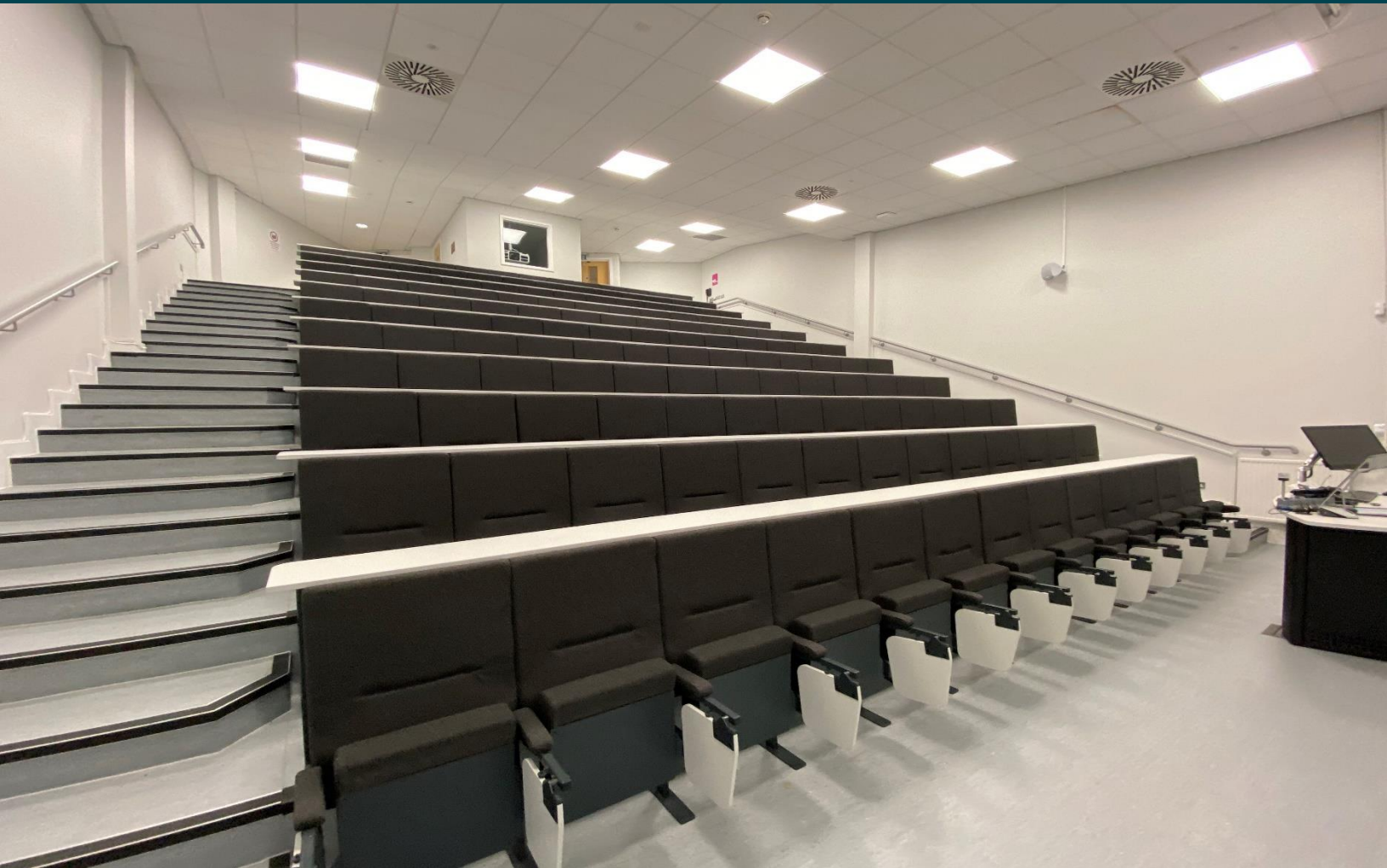
Lecture Theatre 2D1