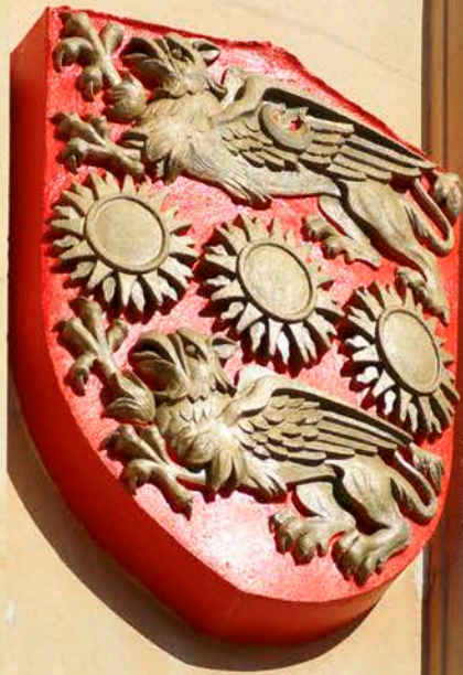
Shield on outside of HH Wills Physics Building