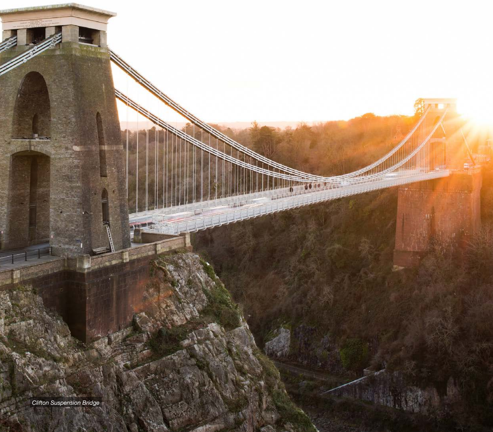
Clifton Suspension Bridge