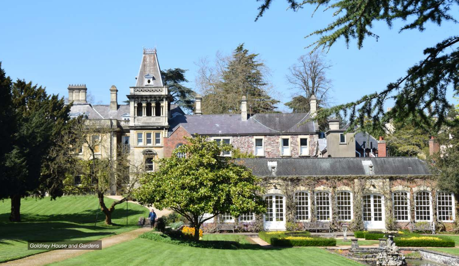
Goldney House and Gardens

shareholder in this particular venture, with 36 of 256 shares at the rate of £103 10s each. 44