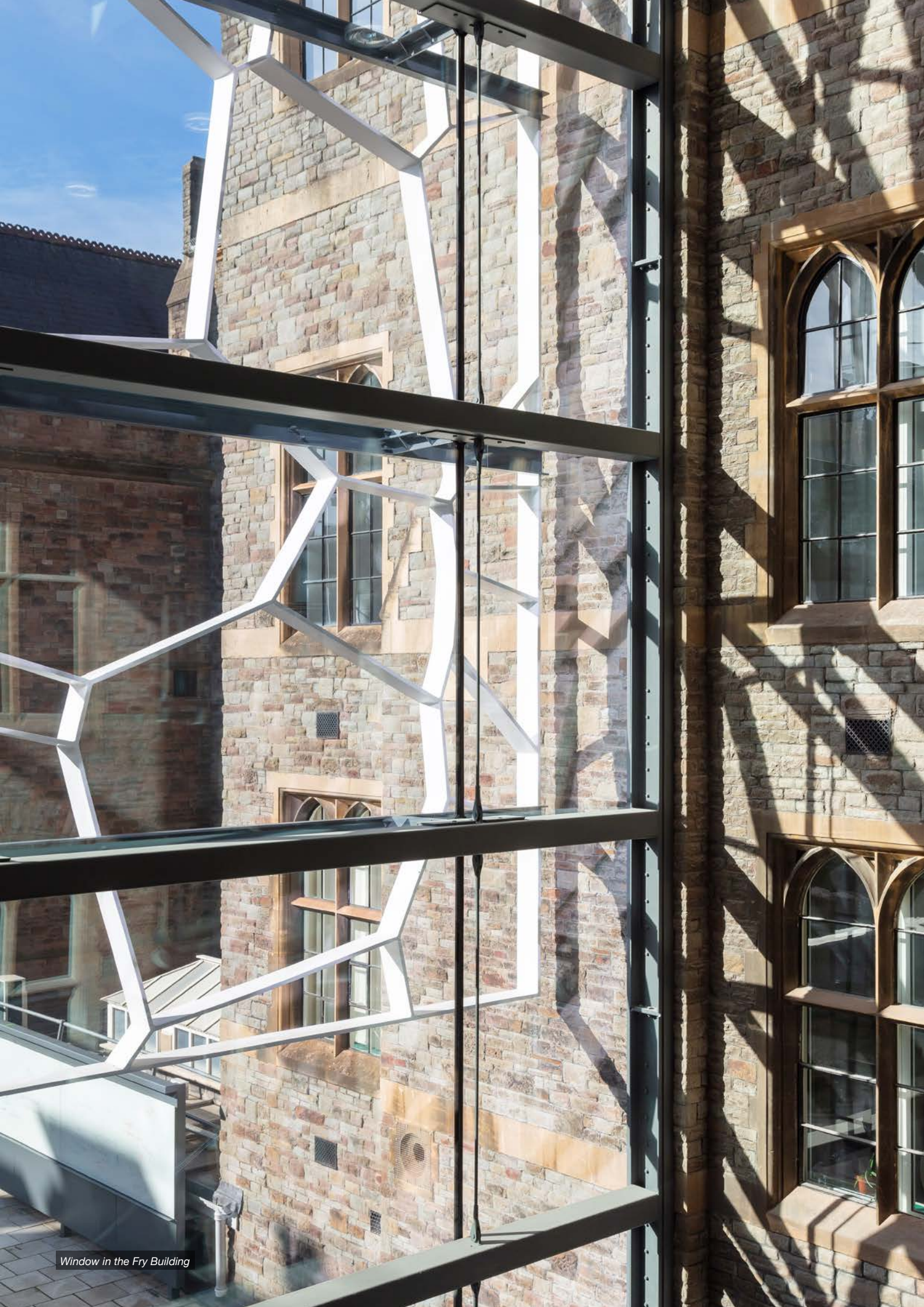
Window in the Fry Building