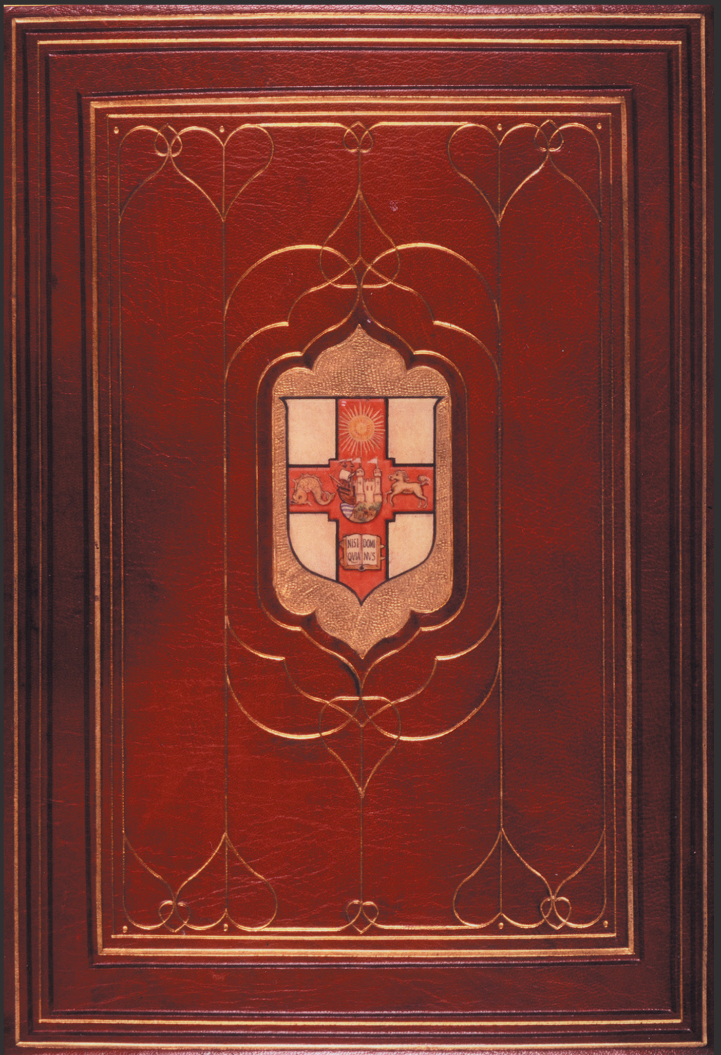
Cover of the Visitors' Book