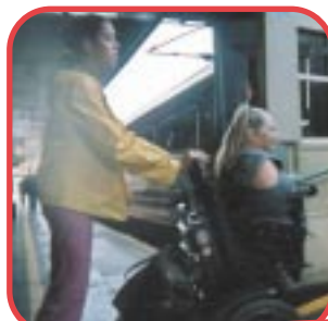
Doing things you enjoy doing