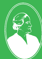
Norah Fry Research Centre

Tel: 0117 923 8137 Minicom: 0117 928 8856 Fax: 0117 946 6553