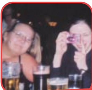
Going out with friends

3 Ask for an assessment of your needs. This means Social Services will want to know the kinds of things you would like to use your Direct Payment for. Make sure the assessment covers things like: