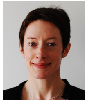
8 July 2016 in Dublin.