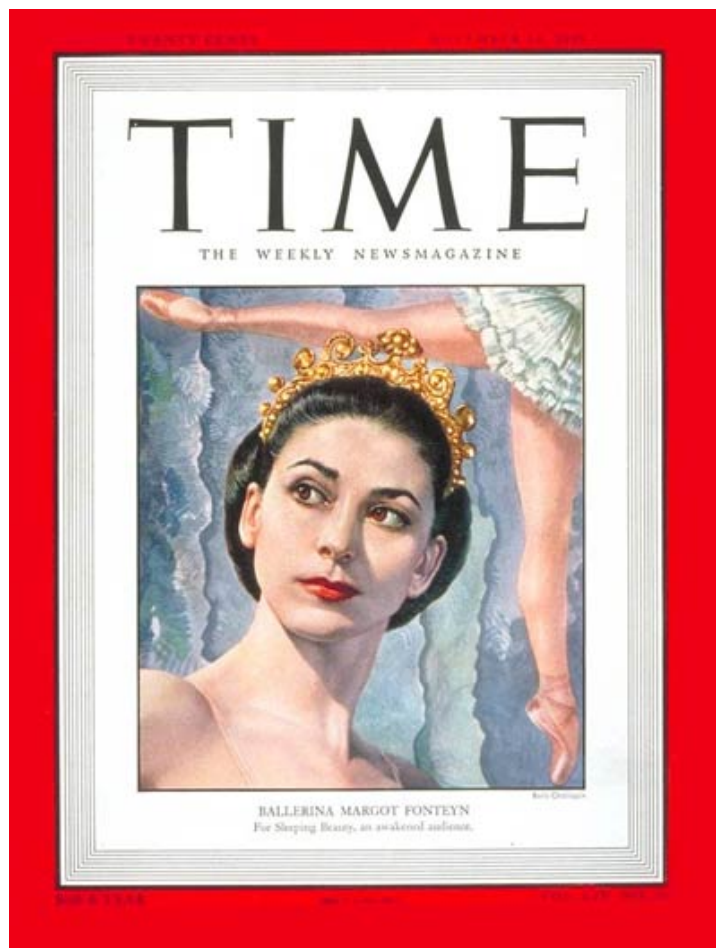
Figure 1: Margot Fonteyn on the cover of TIME . From TIME Magazine (November 14, 1949).