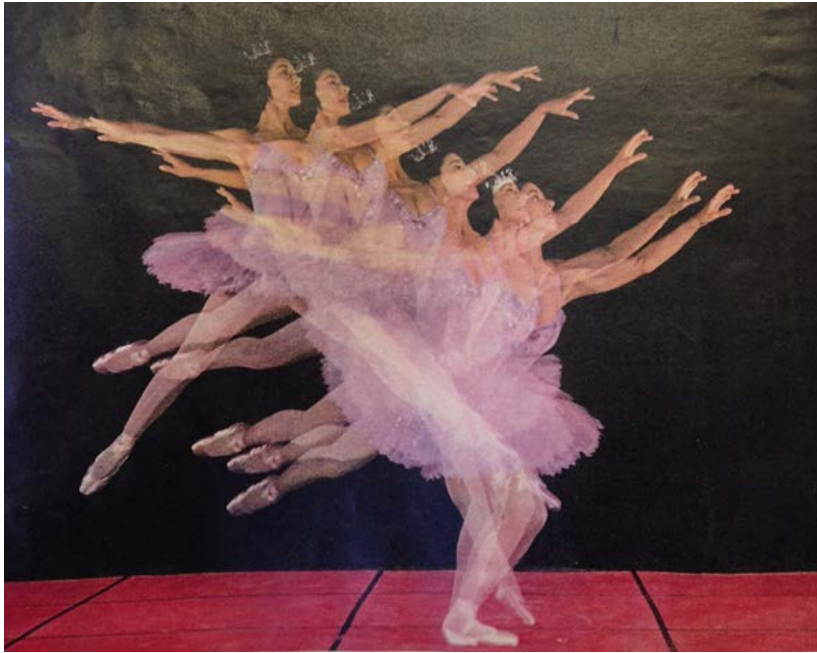
Figure 3: 'Time and Space: A Fractional Analysis of a Leap through the Air', Picture Post , (14 October, 1950), Winifred Edwards Collection, The Royal Ballet School Archives.