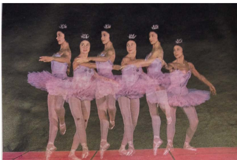
Figure 2: 'Seconds of Movement: The Use of Points in a Rapid Turn', Picture Post , (14 October, 1950), Winifred Edwards Collection, The Royal Ballet School Archives.