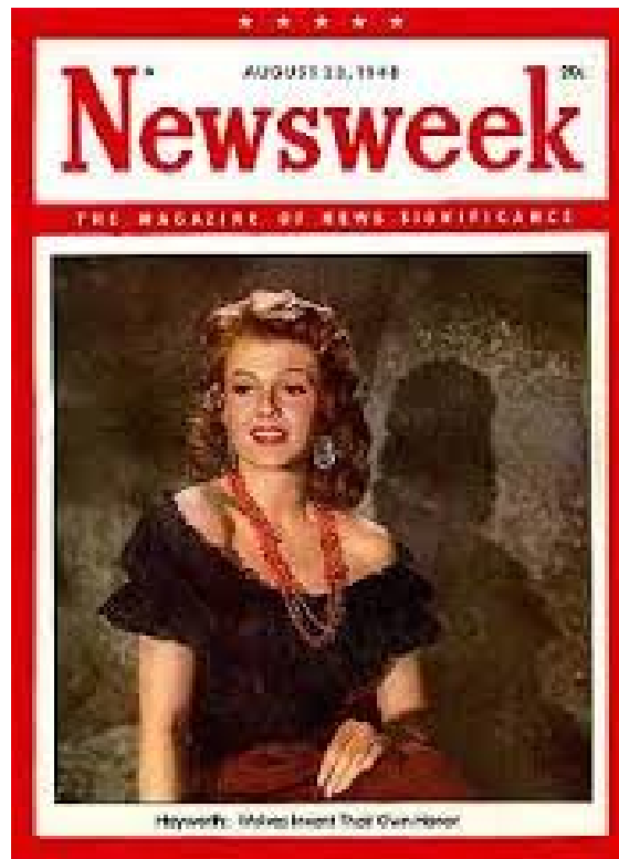
Figure 6: Rita Heyworth on the cover of Newsweek. Newsweek (August 23, 1948).