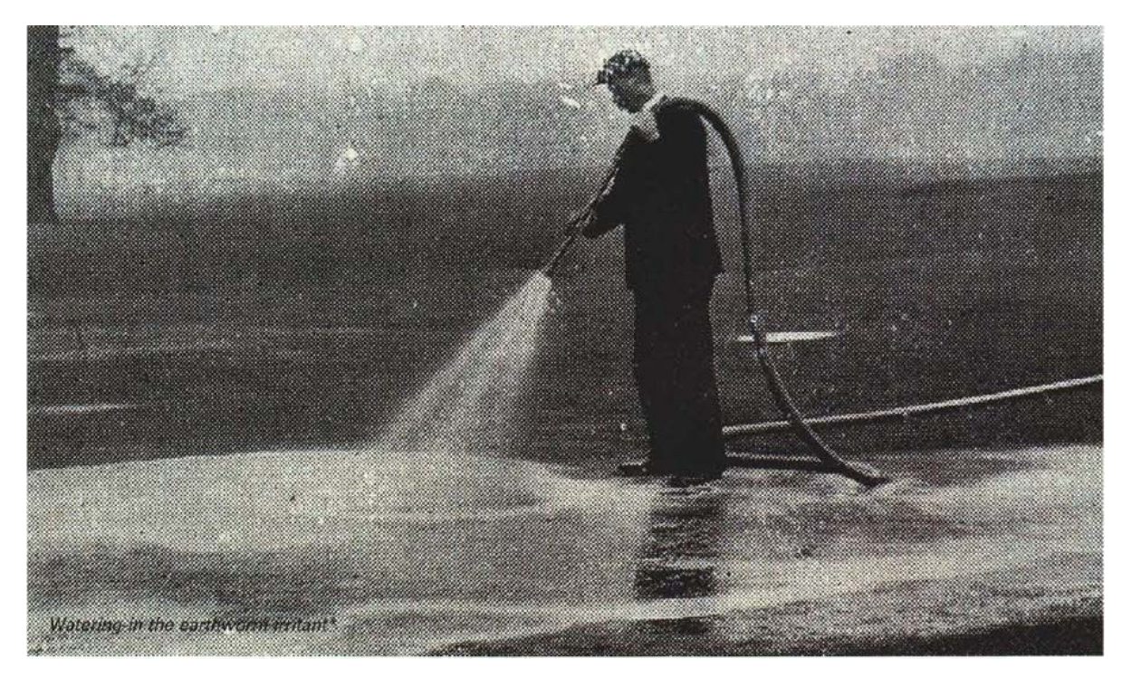
Figure 2. 'Watering in the Earthworm Irritant', R. Beale, Lawns for Sports: Their Construction and Upkeep (London, 1924), 201.

In the 1890s Peter Lees, the English golf course architect, developed an earthworm management control to deal with the 'problem' faced by greenkeepers of earthworm casts on the soil surface. <sup>53</sup> His control method is shown in figure two and involved applying a powdered irritant to the soil surface, in the form of mowrah meal, made from the seeds of Bassia latifolia , the Indian butter tree, and watering it in. As a result of combining the irritant and excessive amounts of water, earthworms came to the surface, were raked into piles and then shovelled on to wheel-barrows and physically removed from the site. <sup>54</sup> Earthworm removal, as a direct response to their influence on the soil environment, was common on golf courses throughout the twentieth century in both Europe and the United States, although