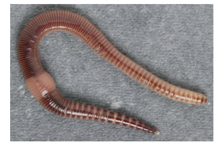
Image right: Eisenia veneta , a compost earthworm Compost earthworm species include Eisenia fetida and Eisenia veneta

As their name would suggest, these are most likely to be found in a compost bin. They prefer warm and moist environments with a ready supply of fresh compost material. They can very rapidly consume this material and also reproduce very quickly. Compost earthworms tend to be bright red in colour and stripy.