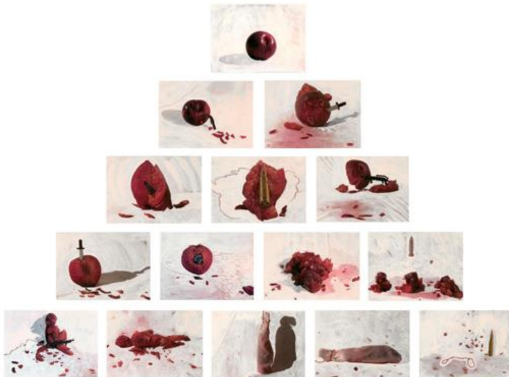
© Gail Ritchie. Little Acts of Cruelty, 2015. Giclee Print over painted with gouache.