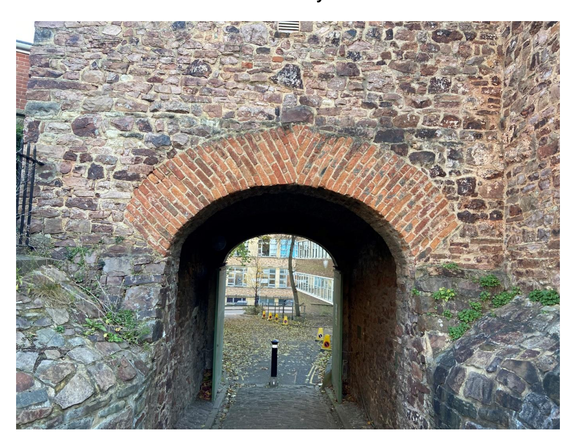
Question 6: What is this entrance to Royal Fort Gardens called?