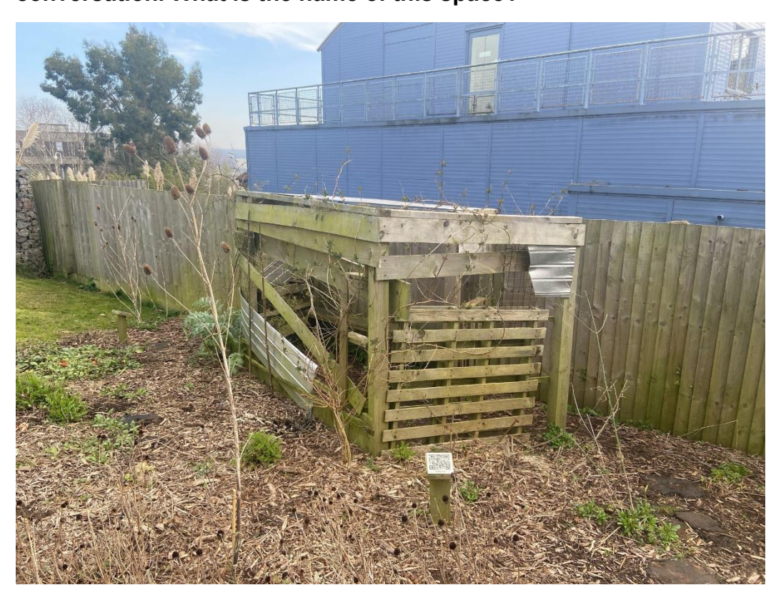
Question 9: This is a space for individual reflection and one to one conversation. What is the name of this space?