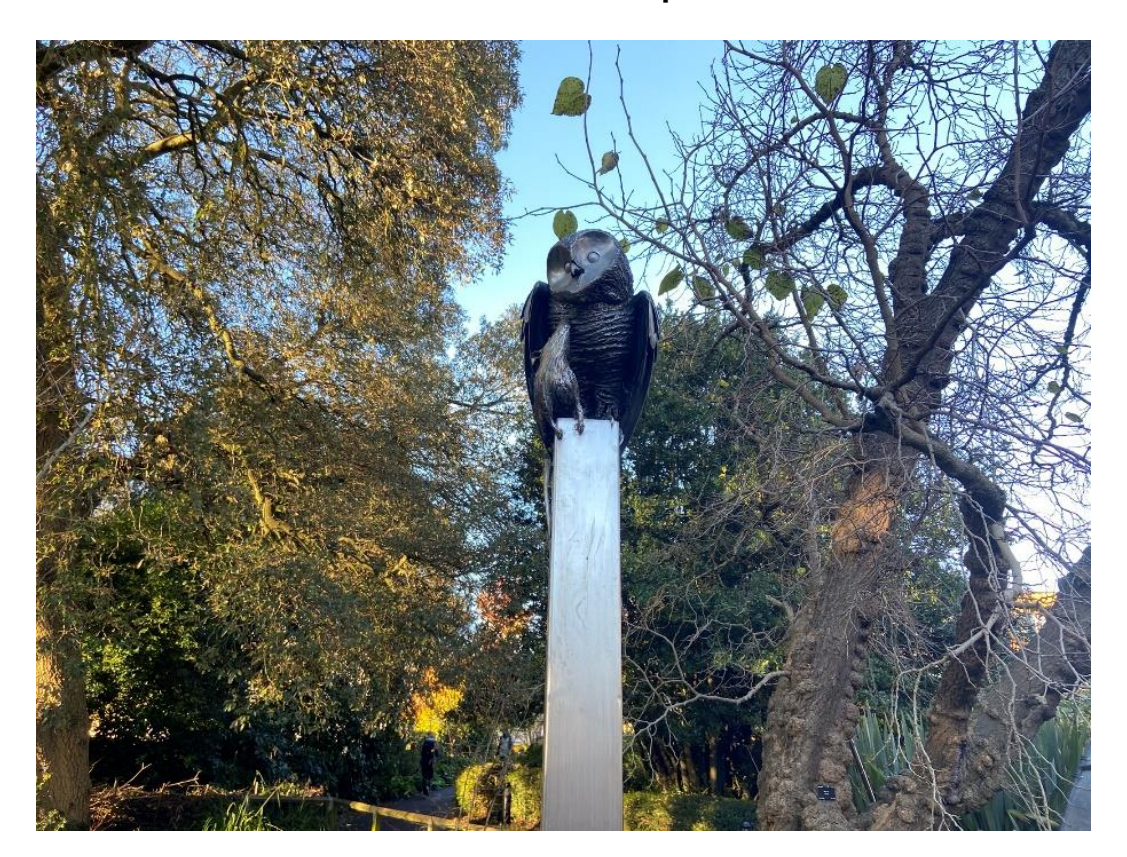
Question 4: What is the name of this sculpture?