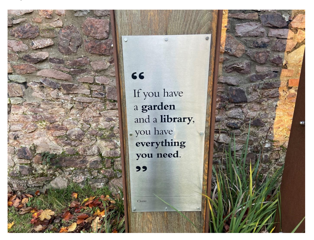
Question 5: Near to the quote below by Cicero, you will find two more. Who are they from?