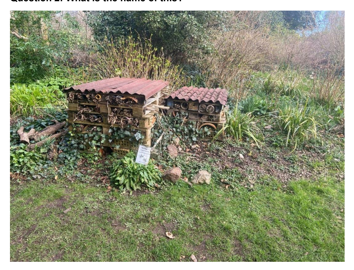
Question 2: What is the name of this?