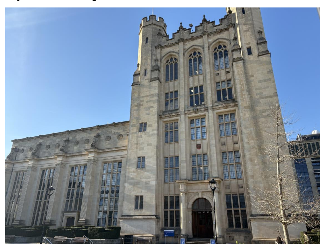
Question 12: How many sun sculptures are there on the entrance side of the Physics Lab building?