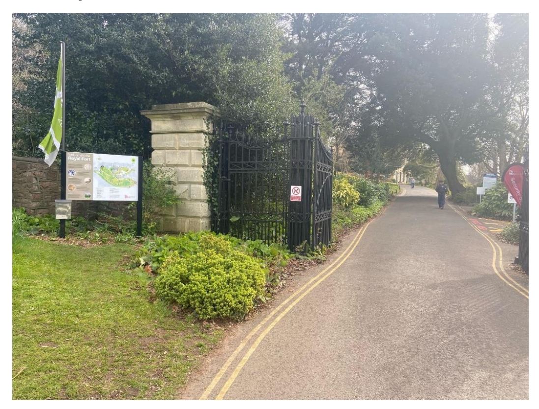
Question 1: In what year were Royal Fort House and its grounds donated to the University?

Use this sheet to check your answers and see how many you got correct.