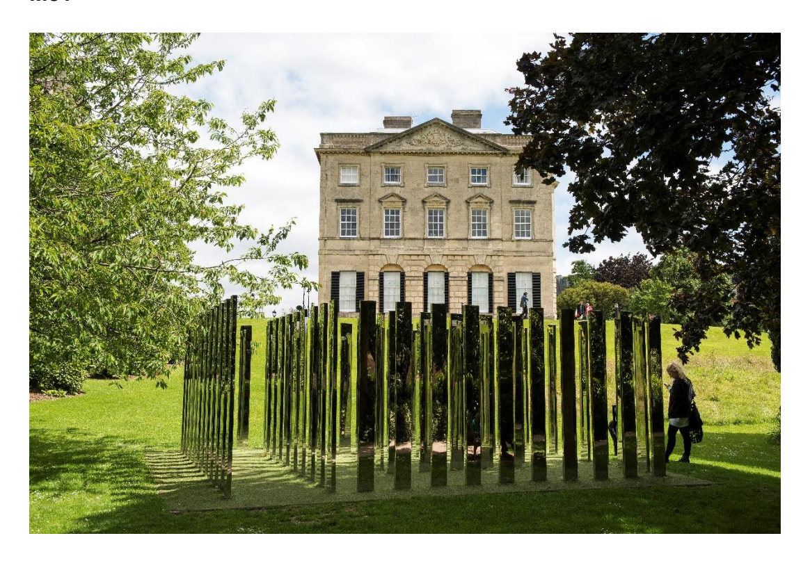
Question 3: How many mirrors make up this sculpture by Jeppe Hein, Follow Me?