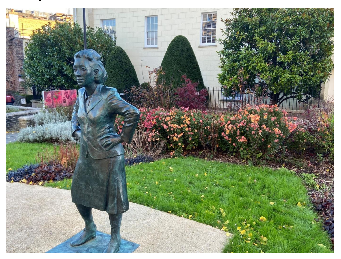
Question 8: Which flower can't be found in the memorial garden attributed to this lady