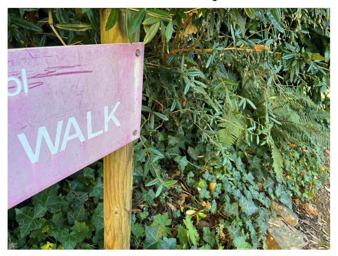
Question 13: What is the full name on this sign?