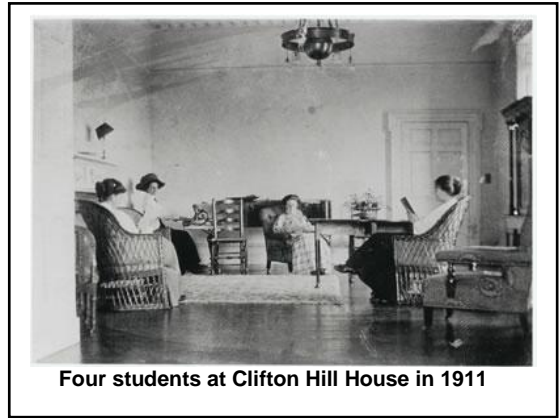
Four students at Clifton Hill House in 1911

It is worth noting that Symonds had been instrumental in the founding of Bristol University College and how pleased the family was when the house was finally sold to the University in 1909 for £5,500, and became the first hall of residence for women in the South West of England. In 1994, a large and little used ladies cloakroom was transformed to house all the remaining possessions of the Symonds family that were scattered in the House. A permanent exhibition with family photographs and memorabilia can now be seen in the Library at Clifton Hill House.