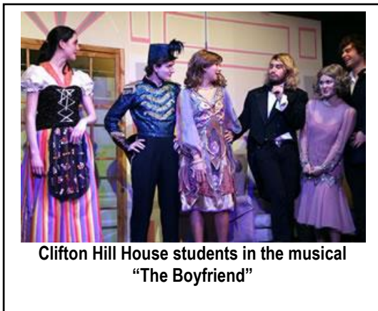
Clifton Hill House students in the musical "The Boyfriend"