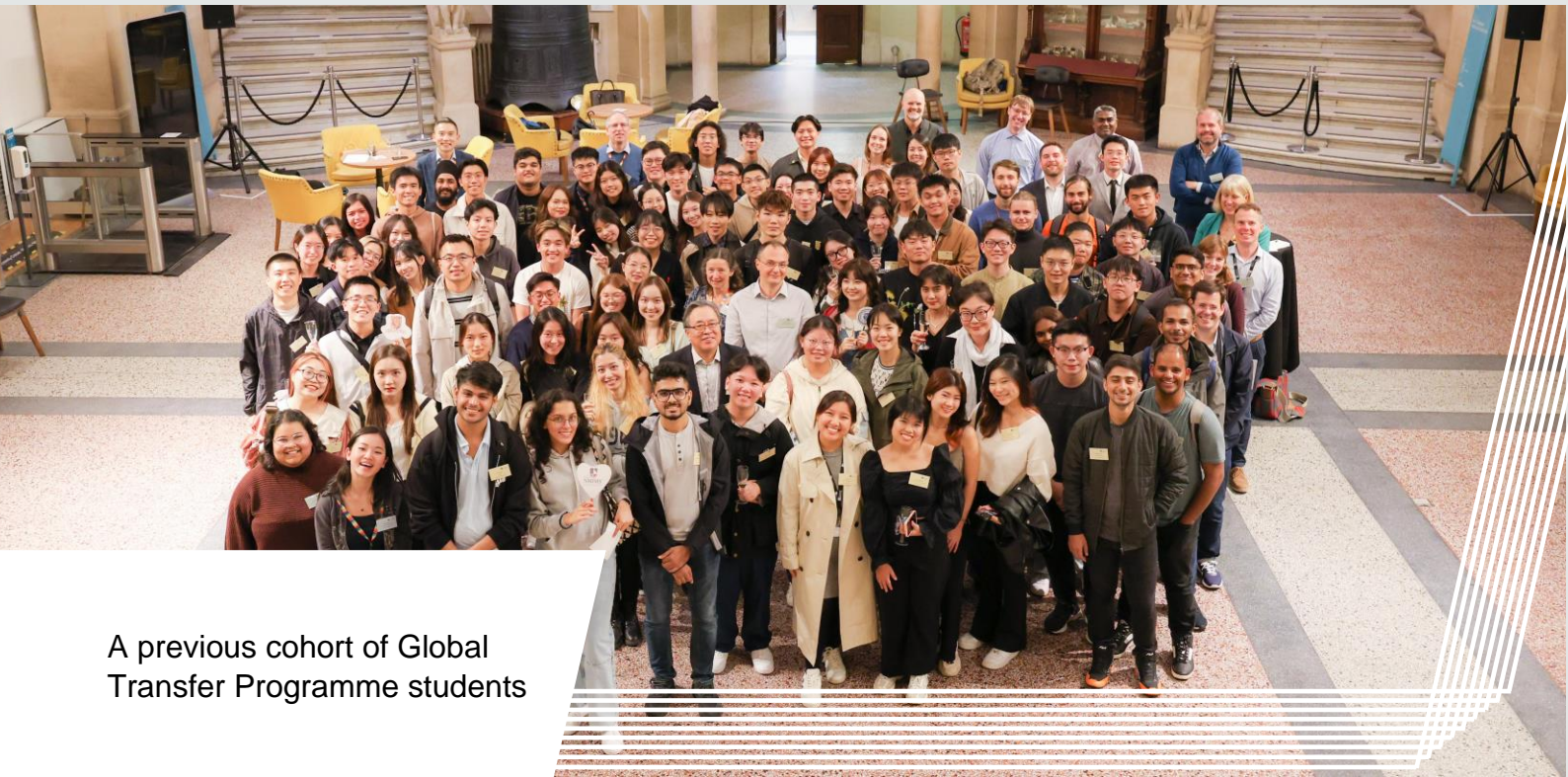
A previous cohort of Global Transfer Programme students