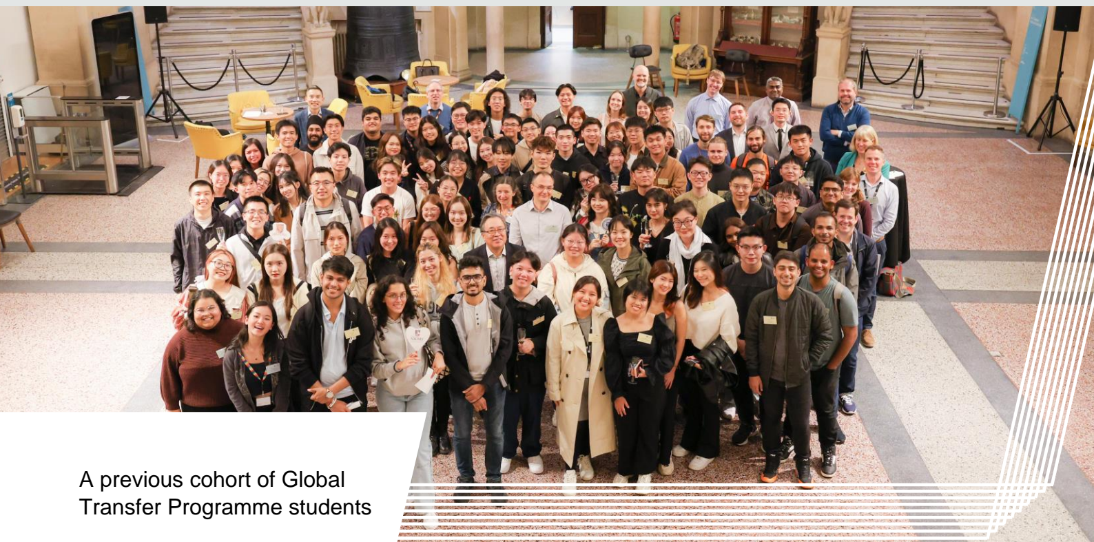
A previous cohort of Global Transfer Programme students