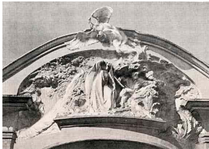
Figure 7 Victor Prouvé Inspiration

project to ensure the movement's future, very much at the heart of Gallé's preoccupations towards the end of his life. Victor Prouvé himself contributed the sculpture for the pediment above the main door (figure 7). This was described as expressing a synthesis of the ideas of the Lorraine movement: both symbolism and close observation of nature, elevated thought, but also hard work and patience. The general theme was