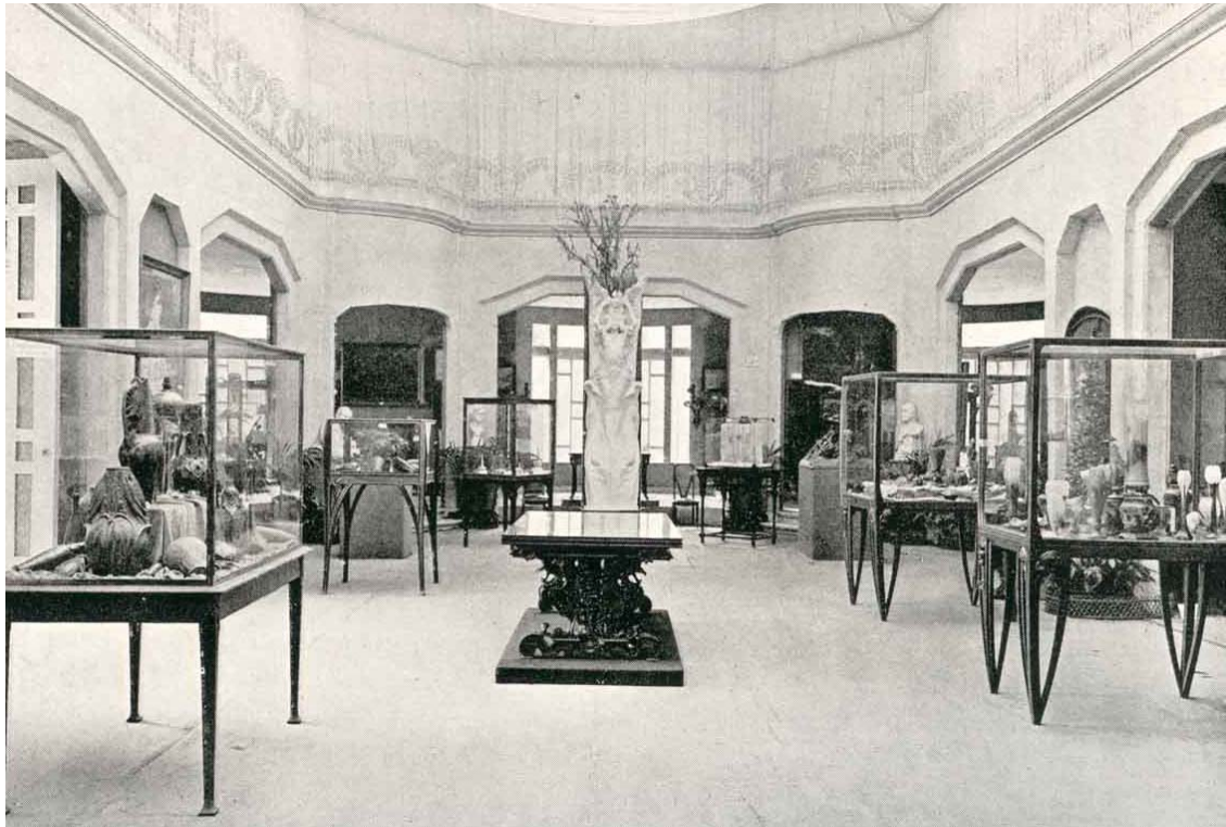
Figure 9 Pavillon de L'Ecole de Nancy – Grande Salle

names. Prouvé himself, whose work was very much in evidence in the exhibition generally, had also been asked to design the main exhibition certificate awarded to prize winners.