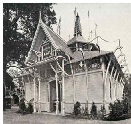
Figure 5 Pavillon de l'industrie du Gaz