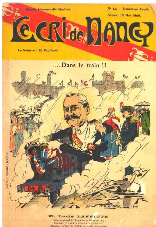
Figure 2 Cover of Le Cri de Nancy , May 1909