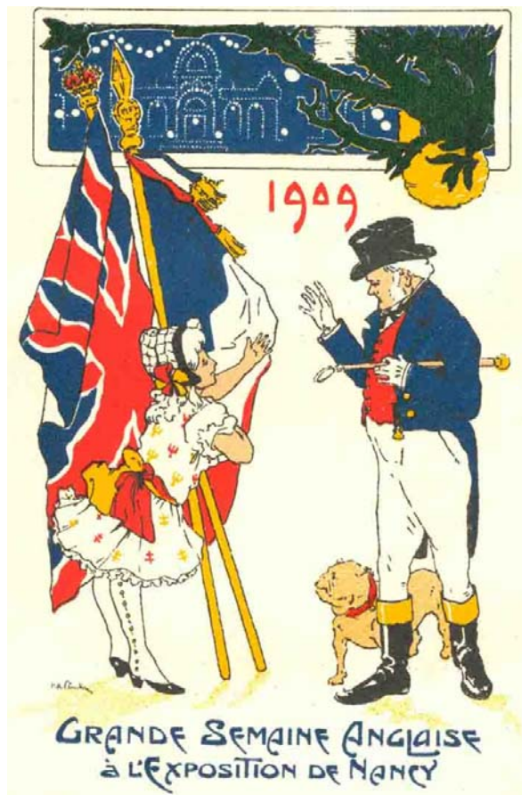
Figure 1 Pierre Claudin lithograph 1909

Exhibitions were very much part of the spirit of the time, the spirit of the Belle Époque. Enjoyment and sometimes extravagance, but also celebration of progress and modernity, such as the wonders of electricity, were some of the characteristics of this extraordinarily confident era. Alongside the vast events held in Paris, such as the 1889 and 1900 Expositions Universelles, a great many regional, and local exhibitions were held throughout Europe which remain less attentively scrutinised. No less than twelve major regional exhibitions were held in France alone between 1878 and 1909, to which many local and more specialised ones could be added. 2 In 1908, the momentous Franco-British Exhibition to celebrate the entente cordiale was held in London, at the White City, in Shepherd's Bush. 3 It received several large delegations from Lorraine. There was even a Lorraine week in London which was mirrored in Nancy by the high profile semaine anglaise , one of the