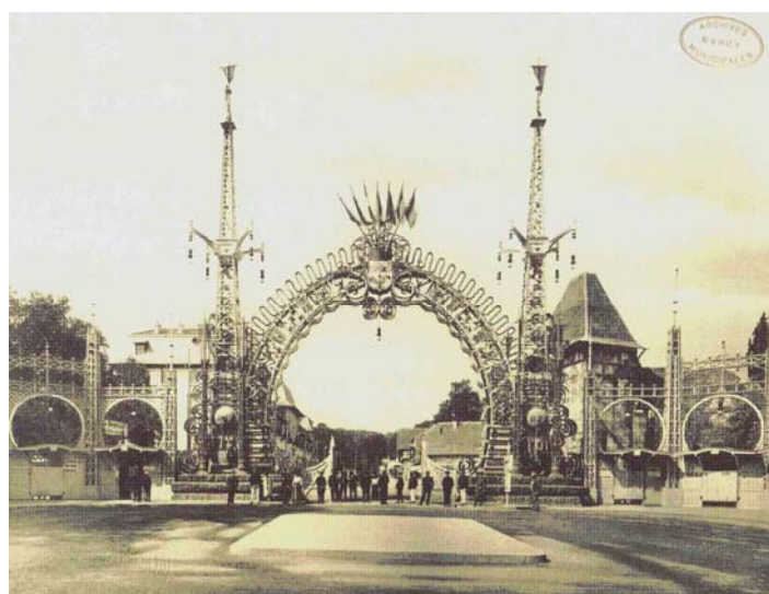
Figure 4 Porte monumentale

Although the palaces had been initially planned along wide themes, exhibits, which covered