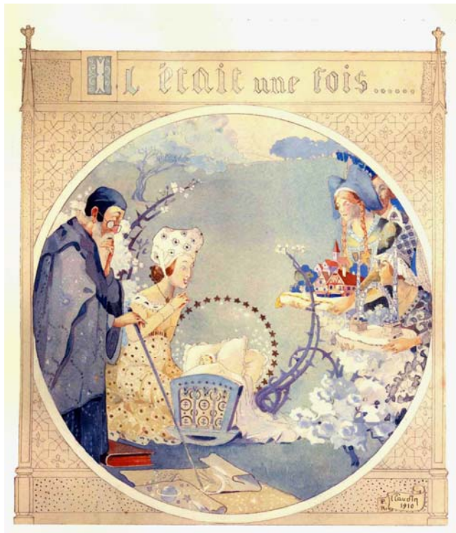
Figure 11 Pierre Claudin watercolour, 1910

If the success of the Exhibition momentarily produced the glitter of a fairy tale for the town of Nancy and the region, for the Ecole de Nancy, sadly, it turned out to be a swansong. 28 Although its powerful presence was felt everywhere in the Exhibition, and many pavilions and exhibits were witness to the vitality of individual artists, the disappointment over the pavilion