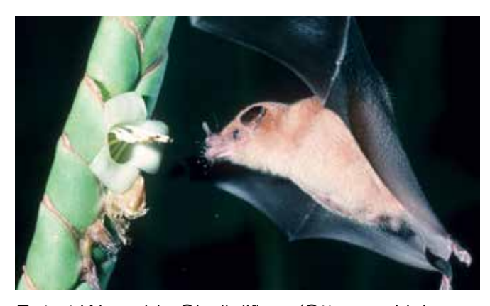
Bat at Werauhia Gladioliflora