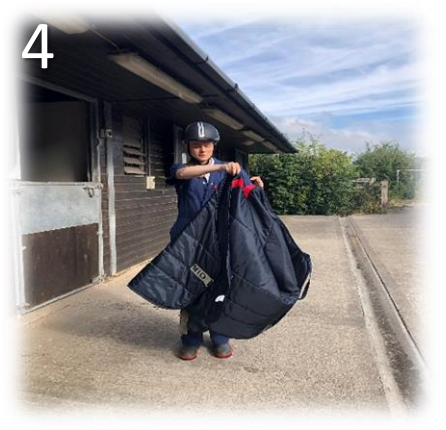
Pass the head end of the rug (in your right hand) to meet the tail end of the rug (in your left hand) and hold both together in your left hand.

Hold the half folded rug in front of you with the head end in your right hand and the tail end in your left hand.