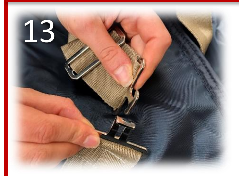
To fasten the surcingles insert the end of the surcingle strap vertically into the clip.