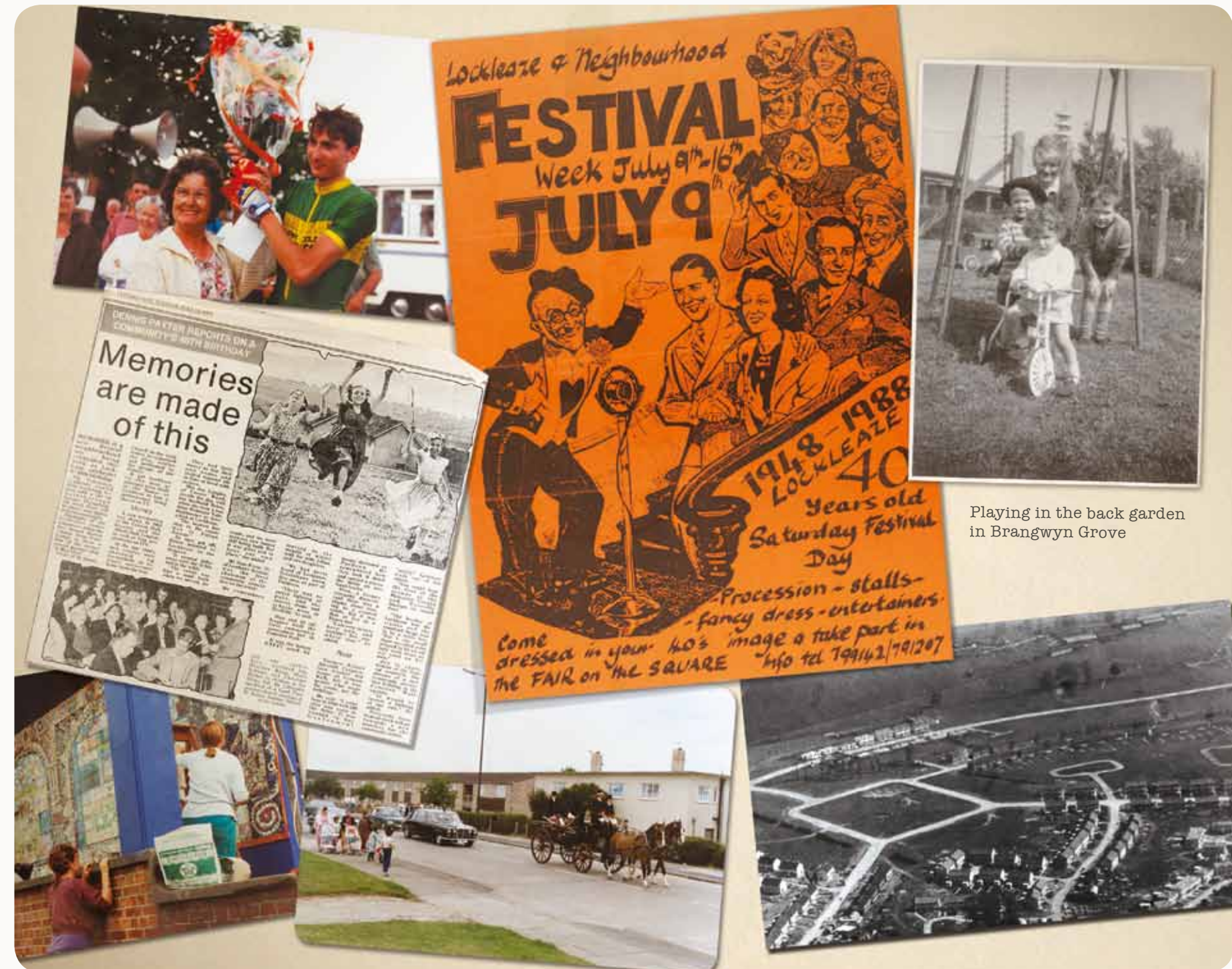
Playing in the back garden in Brangwyn Grove

Clive Bull remembers the ex-army camp on Purdown