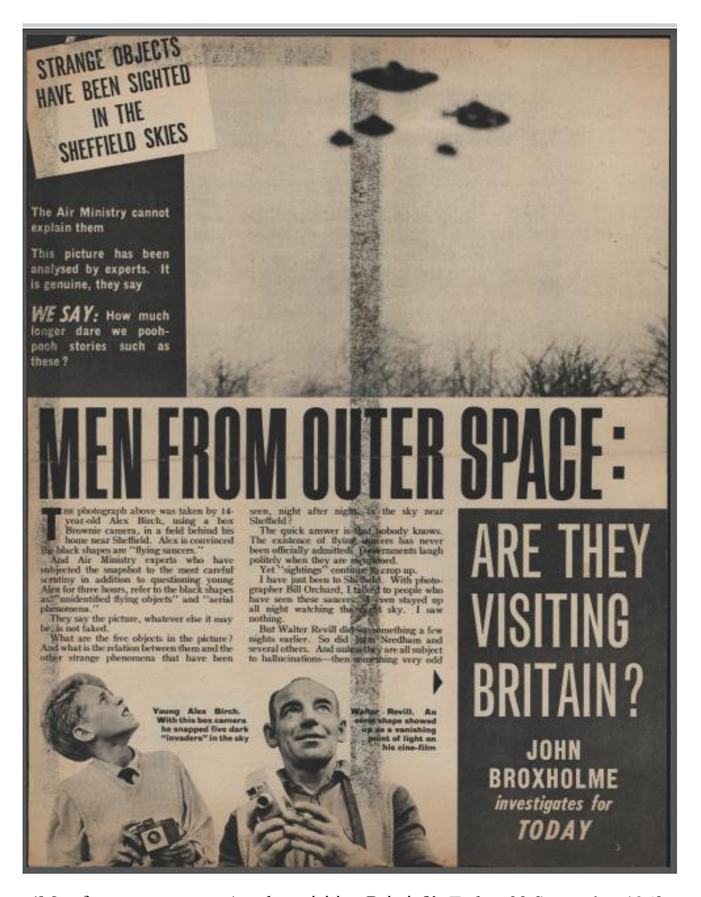
'Men from outer space: Are they visiting Britain?', Today, 22 September 1962.