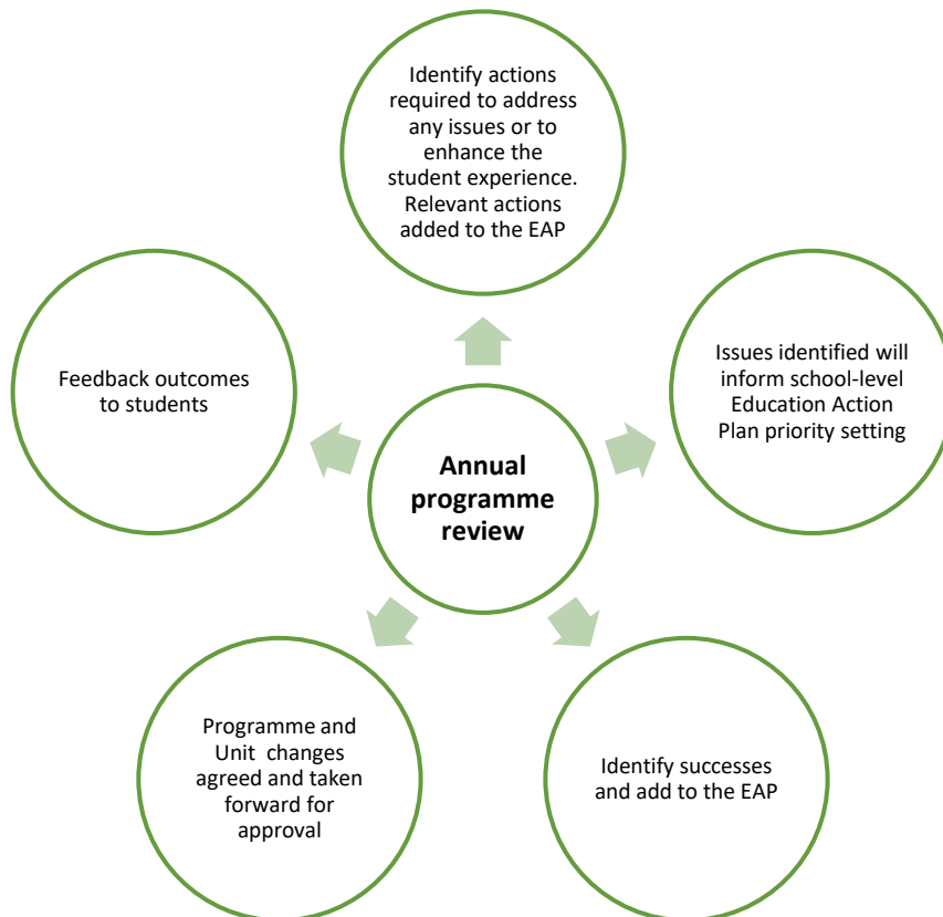
Figure 2: Annual Programme Review OUTPUT for all programmes